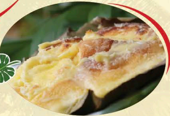
BIBINGKA $3.95 Rice cake made from real "galapong", egg and milk, topped with white cheese. Served with grated coconut GLUTEN FREE