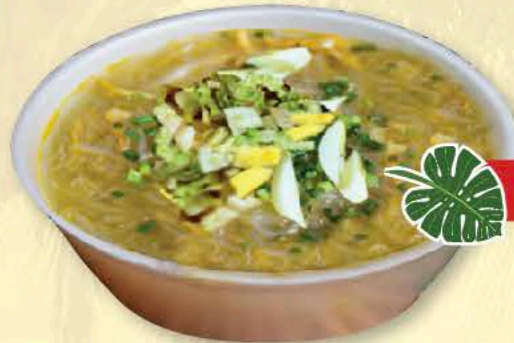
CHICKEN SOTANGHON $3.55 Chicken soup with glassy noodles topped with egg, garlic and spring onions