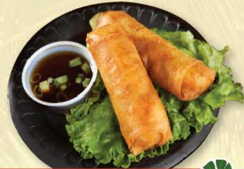
FRIED LUMPIA $2.75 Fried vegetable roll served with a garlic and vinegar dip (2 pieces)