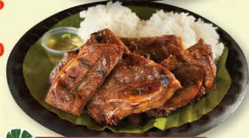
BEEF KOREAN BBQ