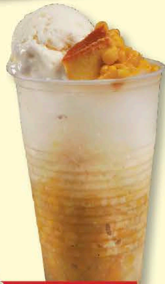
MAIZ CON HIELO