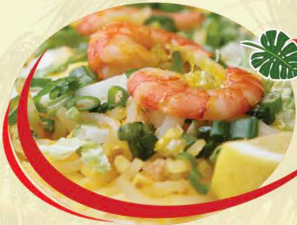
PANCIT MALABON $4.75 Rice noodles with special Manila Sunset sauce, topped with shrimps, egg, chicharon and vegetables