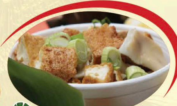
TOKWA'T BABOY $2.95 Deep fried tofu with minced pork cuts in a garlicky, sweet and sour special sauce.