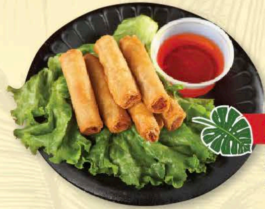
LUMPIANG SHANGHAI $2.95 Mini crisp egg roll with minced pork and vegetables, served with sweet and sour dip (6 pieces)