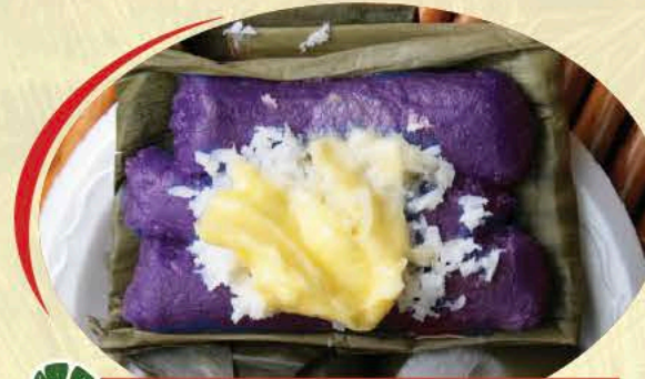
PUTO BUMBONG $2.65 Purple rice, wet ground and steamed in bamboo tubes, topped with grated coconut, butter and sugar GLUTEN FREE