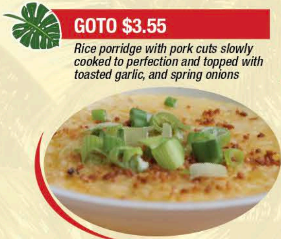
GOTO $3.55 Rice porridge with pork cuts slowly cooked to perfection and topped with toasted garlic, and spring onions