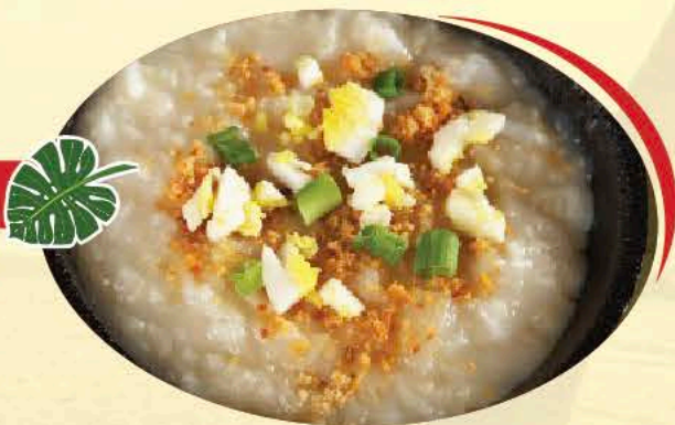
ARROZ CALDO $3.55 Rice porridge with chicken, seasoned with toasted garlic and spring onions.