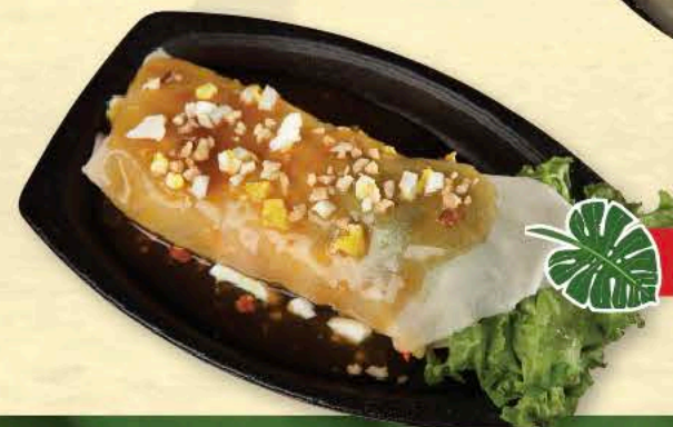
FRESH LUMPIA $3.45 Sautéed mixed vegetables rolled in a crepe-like wrapper with lettuce and peanuts, served with semi-sweet sauce.