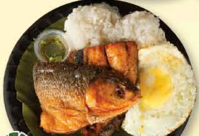
DAING NA BANGUS