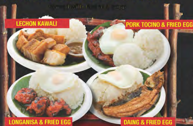
LECHON KAWALI PORK TOCINO & FRIED EGG LONGANISA & FRIED EGG DAING & FRIED EGG

SUBSTITUTE FOR additional egg or garlic fried rice add 75¢