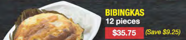
BIBINGKAS 12 pieces $35.75 (Save $9.25)