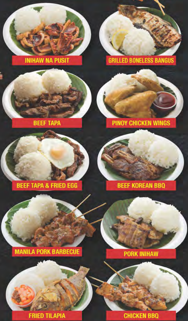
INIHA NA PUSIT GRILLED BONELESS BANGUS BEEF TAPA PINOY CHICKEN WINGS BEEF TAPA & FRIED EGG BEEF KOREAN BBQ MANILA PORK BARBECUE PORK INIHAW FRIED TILAPIA CHICKEN BBQ