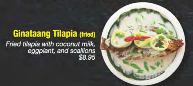
Ginataang Tilapia (fried) Fried tilapia with coconut milk, eggplant, and scallions $8.95

Crispy Pata Marinated pork knuckles deep fried to perfection served with our own special sauce $17.95